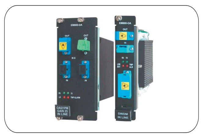
Optical Amplifier modules

LambdaDriver<sup>®</sup> Optical Amplifier modules are a family of low-noise Erbium-Doped Fiber Amplifiers (EDFA) ideal for Metro and Long-Haul Dense Wavelength Division Multiplexing (DWDM) as well as Single Wavelength applications. The optical design, coupled with sophisticated control circuitry, allows these Optical Amplifiers to provide constant gain even with wavelengths being added or dropped in the network. Any fluctuations caused by wavelengths addition/ removal can be handled by its ultra-fast transient suppression.